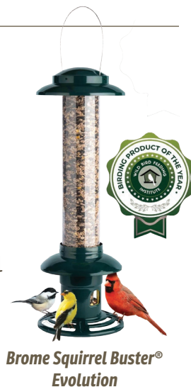
Brome Squirrel Buster® Evolution

This feeder is easy to disassemble and thoroughly clean, which is important for both birds and humans. The Evolution feeder itself holds 1.9 pounds of seed. By using a squirrel-resistant feeder, bird enthusiasts save money on seed. ■