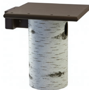
Gilbertson PVC Bluebird Box with poly roof

nest box, it removes easily, allowing you to easily check on nestlings. This nest box comes with drainage holes, proper venting, and toe holds under the entrance to help fledglings. It mounts to a ½-inch conduit pole, available in our stores. If you want to learn more about bluebirds, stop in at any of our six locations and we would be happy to help you.