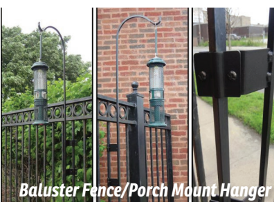
Baluster Fence/Porch Mount Hanger

Similar to the support ring, the Erva Iron Fence/Porch Mount