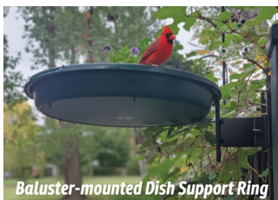
Baluster-mounted Dish Support Ring

As people are transitioning to more maintenance-free decking, there are options specifically designed for metal balusters. The Erva Iron