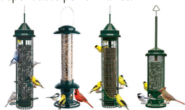
Squirrel Buster® feeders: Classic, Evolution, Finch, Legacy.

Brome Bird Care is known worldwide for designing high-quality, durable, and innovative feeders. Their Squirrel Buster® line of feeders are trusted favorites that combine clever engineering with dependable performance.