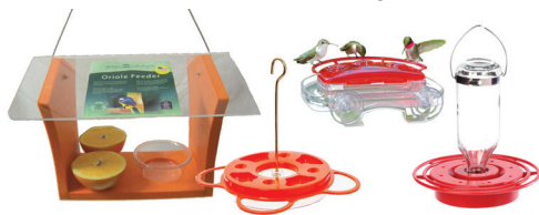
Recycled Oriole Feeder, Oriolefest, Jewel Box Window Feeder, Best-1 Hummingbird Feeder

Bring the wonder of nectar feeders into someone's life. Hummingbirds and orioles dazzle with their color and activity, making nectar feeding a delightful choice for those who may not be able to serve seed, such as apartment dwellers. They're also a wonderful introduction to bird feeding—perfect for new homeowners eager to welcome nature into their backyards.