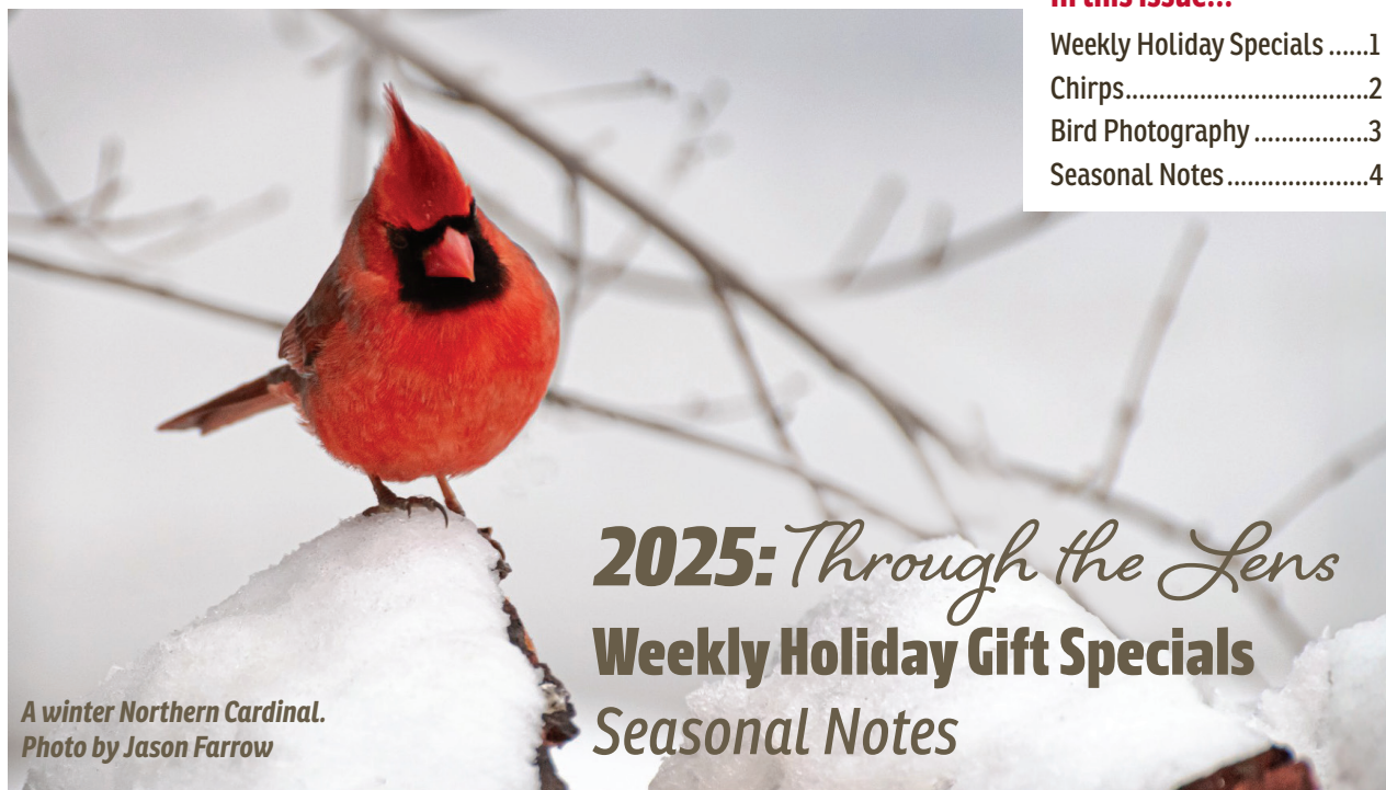
A winter Northern Cardinal.