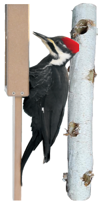
Recycled Double Suet Feeder, Large Suet Log Feeder

Suet feeders are among the easiest and most effective feeders for attracting birds. Just slide in a suet cake—or suet plugs for a birch log feeder—and enjoy the show. Woodpeckers from Downy and Hairy to Pileated are frequent visitors, along with chickadees, nuthatches, and more. These feeders make excellent gifts for anyone who wants a low-maintenance yet highly rewarding way