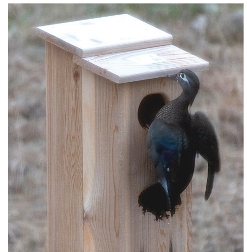
A Wood Duck hen attends to her nest.