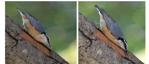
A Red-breasted Nuthatch tucks a seed under some bark.

busy movements between the feeders, tree, and birdbath when they do arrive. Their quick, darting movements and endless energy make them a delight to observe.