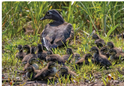
A Wood Duck hen and chicks.

A little effort in the fall can lead to the unforgettable experience of watching Wood Ducks raise their young come spring—right in your own backyard. ■