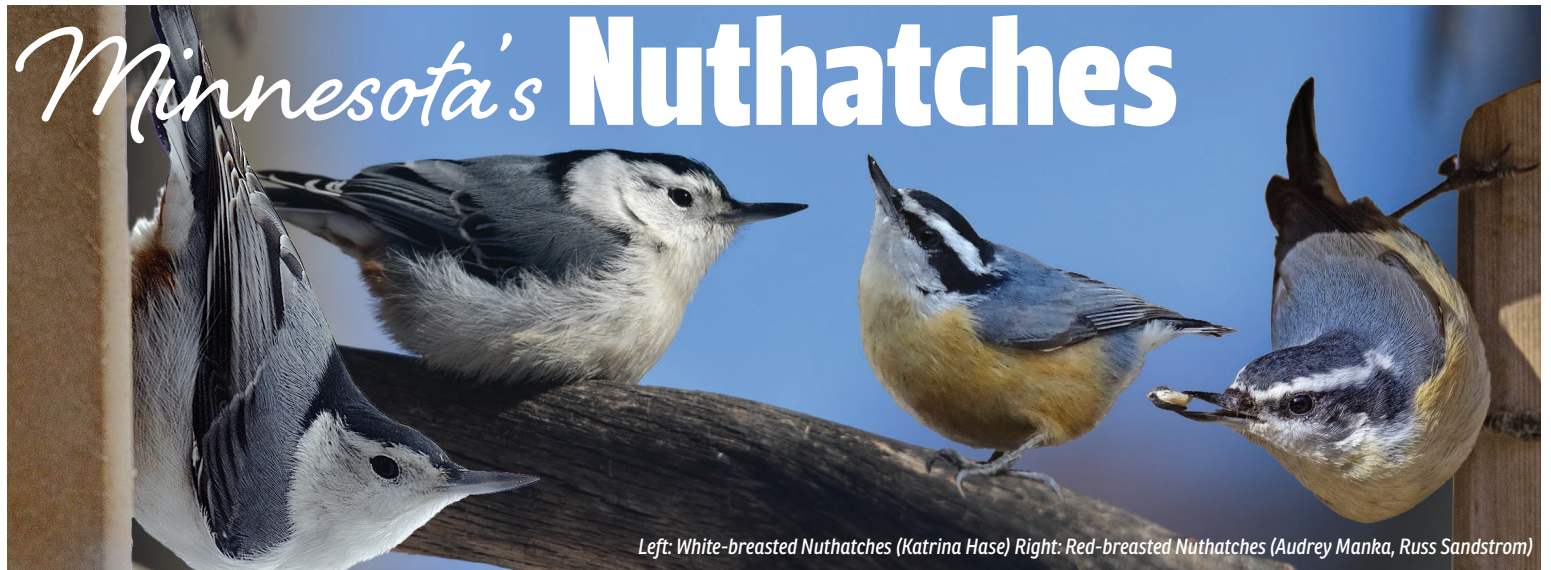
Left: White-breasted Nuthatches Right: Red-breasted Nuthatches