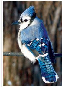
▲ A Blue Jay looking over its shoulder

For instance, goldfinches—males—have beautiful stripes on their wings that you don't see most of the time. If I can get them looking over the shoulder so you can see the eye and the wings—that's a good shot. Blue Jays are like that too.