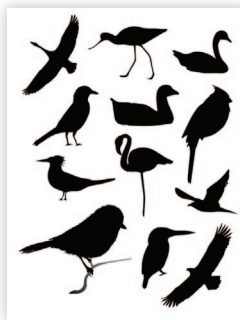
▲ GISS considers bird size and shape to identify birds

When using the GISS method of identifying birds, you can use flight patterns, walking style, various other movements, plumage characteristics and, of course, song to identify birds. Think of it in the way you identify people from a distance. We each have a unique posture, hair style, walk, movements of other body parts (like how we swing our arms) and, of course, voice. Our voices are unique (continued on page 4)