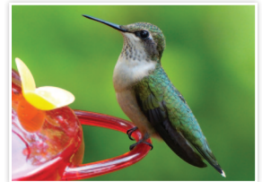
▲ A hummingbird shines in morning light

Lighting. The light is best right after sunrise and before sunset. About 30 minutes before sunset makes everything so beautiful! If the sun is out that day, I'll make a point to go out that evening right before sunset.