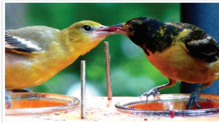
▲ A male Baltimore Oriole feeding a female

I like shots that show two birds in one frame. You may get a shot that shows a parent feeding a baby bird or something like the Wood Duck in a tree with a Baltimore Oriole in front.