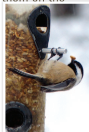
▲ A chickadee doing “push-ups”

Unusual features. A lot of shots I don't realize what I've got until I get them on the computer, like a photo I took of a balding cardinal. Those accidents turned into something I look for now. Or sometimes I'll just be photographing a bird, like a chickadee on a feeder, and I'll be snapping away when it flips upside down and looks like it's doing push-ups. It's just luck!