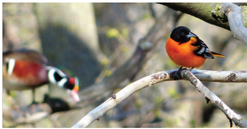
▲ Baltimore Oriole with a Wood Duck in background

A: Patience. I know the birds are going to be there. I just sit in my daughter's Rainbow® playset—I put a patio chair up there—and wait. You need to sit and observe. I've learned a trick is to sit there for 15-20 minutes, because going out there disturbs the birds. After that time, the birds start to go back to their normal behavior.