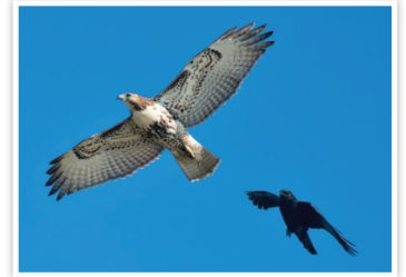
Crows and jays may fly toward alarm calls and coerce the predator to leave.

Sometimes the alarm calls bring in other, larger songbirds to mob and confuse the intruder—typically a hawk—with a flurry of sound from birds that hide in nearby trees and shrubs. It's hard for raptors to tell where the sound is coming from. Some birds, like nuthatches, freeze in place. Jays and crows usually fly towards the sound in order to mob the intruder and get it to leave. These birds will try to surround the perched hawk, using loud, noisy calls and usually the hawk gives up and leaves. ■