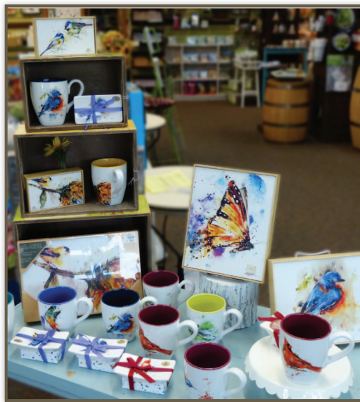
Holiday gift selections