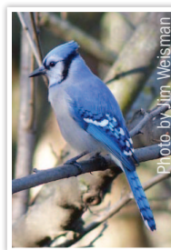
▲ Blue Jays live at forest edges

Blue Jays are birds of the forest edges, often seen near oak trees in forests, woodlots, towns, cities and parks. A Blue Jay nest is a bulky open cup made of twigs, grass, bark strips and moss; it is often held together with mud. The nest is lined with other fine materials and frequently decorated with paper. Nests are usually found in the V-shaped branch connections of trees, usually 8–30 feet above the ground.