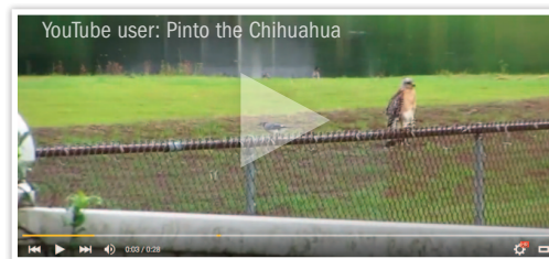
▲ Hear a Blue Jay vocalize as it chases away a hawk: http://wildbirdstore.com/2014/10/bluejay/

Other species also benefit from the Blue Jay's alarm call, alerting them to a nearby predator. Blue Jays frequently mimic the calls