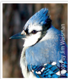
▲ A Blue Jay can raise or lower its crest based on its mood

This large-crested bird has various shades of blue, black and white feathers. The black across the face, nape and throat varies among Blue Jays and may help them recognize one