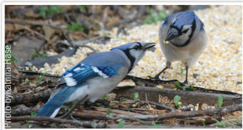
▲ An example of Blue Jay courtship

It's hard to tell the difference between the male and female Blue Jay. Females tend to be a bit smaller in size, but it's hard to distinguish the relative size on individual birds. Observation of behavior is the only