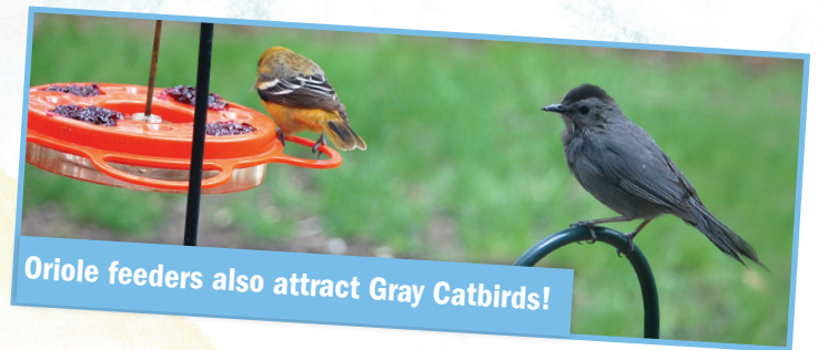
Oriole feeders also attract Gray Catbirds!