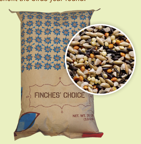
Finches' Choice seed mix appeals to many species of birds.

beautiful Indigo Bunting—flock to our Finches' Choice seed. This seed mix contains sunflower chips, canary seed, millet, Nyjer™ and flax seeds. Buntings occasionally like the Nyjer™ and millet. The sunflower chips and flax seed provide high-energy fat and protein that benefit the birds year-round.