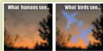
▲ WindowAlert™ decals

of sunlight that's visible to birds, but not to humans. Select from a variety of shapes such as leaves, butterflies, hummingbirds and snowflakes. Place WindowAlert decals on the outside of the window and replace the decals every 6–9 months for best results.