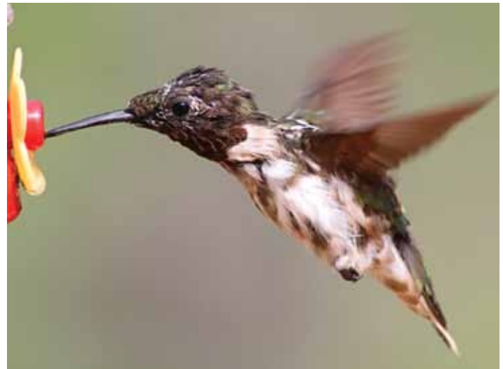
A Ruby-throated Hummingbird, mid-molt ▲

B irds spend a great deal of time caring for their feathers because their lives really do depend on them. A bird's feathers keep them warm and dry, camouflage them from predators, attract mates during breeding season and, most importantly, give them flight.