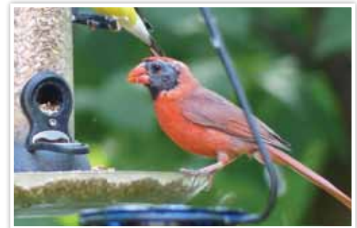
▲ A balding cardinal, taken by Jim Weisman, staff member at the Wayzata All Seasons Wild Bird Store.

While birds typically grow and replace their feathers gradually—and usually symmetrically—sometimes a bird loses a big cluster of feathers on its head at once. This produces a very strange-looking