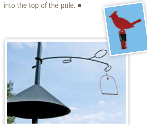
▲ Above: a squirrel baffle and 24" branch-shaped arm with a bird swing on our 1"-diameter pole. Upper right: a red cardinal finial for the top of pole stations.

Finally, enhance your feeding station with a red cardinal silhouette finial that inserts into the top of the pole. ■