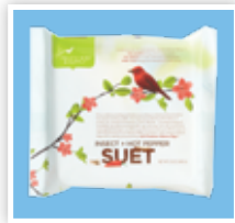
▲ Pacific Bird Insect and Hot Pepper suet.

How can you keep squirrels out of your suet? Let me count the ways! First of all, try a suet cake with hot pepper like Pacific Bird™ and Supply Co. insect and hot pepper cake .