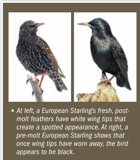
▲ At left, a European Starling's fresh, post-molt feathers have white wing tips that create a spotted appearance. At right, a pre-molt European Starling shows that once wing tips have worn away, the bird appears to be black.

Feathers of the wing tips are subjected to the most wear. You can observe this in the plumage of European Starlings. Following their fall molt, new feathers with white tips grow in, giving starlings a spotted