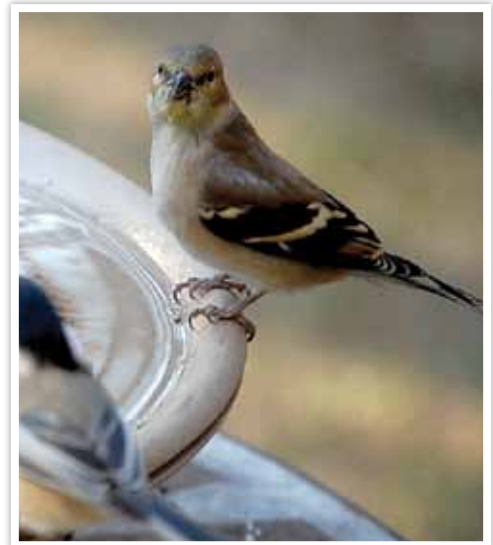
▲ Goldfinches make the switch to fall plumage.

Transitioning your yard into fall and preparing for winter helps you to anticipate the visitors you'll receive in the upcoming months. Roll out the welcome mat and get ready to smile. ■