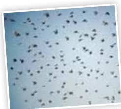
▲ Songbirds collect in flocks.

A combination of shorter days, lower temperatures and changes in food supplies triggers birds to migrate. Migrating birds cover thousands of miles, completing their journey in as little as three weeks and traveling the same course year after year with little deviation in their pathways.