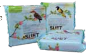
▲ Pacific Bird Suet

Peanuts and suet are other great foods to offer birds in the winter not only because of their high protein and fat levels but because of the extra boost of energy they offer. Peanuts don't freeze so they are an easy source of energy for your backyard birds. For high calories, suet is one of the best foods to offer birds. Suet is a high-energy, pure fat substance that is invaluable to our winter birds. Our Pacific Bird Suets also contain mealworms , which provide additional protein.