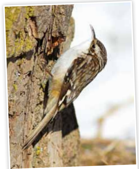
Effective camouflage coloring can make Brown Creepers difficult to see.

satisfying to know that you can help these tiny birds survive Minnesota's extremes just by offering suet where they are comfortable consuming it.