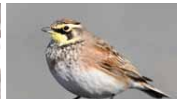
Horned Larks return