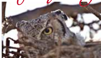
Great Horned Owls nest