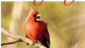
Cardinals begin to sing